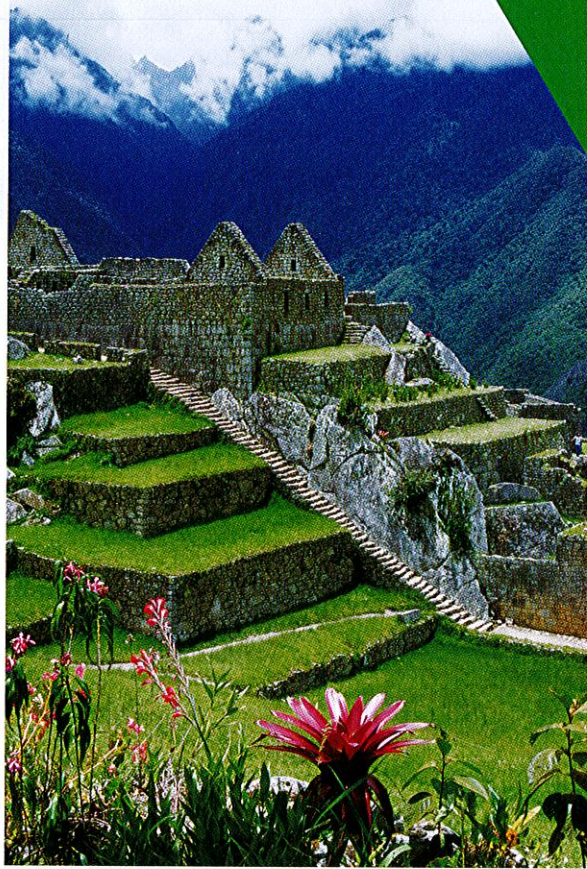
Machu Picchu Flowers grow on the slopes of Machu Picchu today.

The Inca adapted to difficult conditions. They built 14,000 miles of roads on which runners carried messages. To keep records, they used quipus (KEE•poos), counting tools of knotted cords. Today's descendants of the Inca, the Quechua (KEHCH•wuh), make up about 45 percent of Peru's population. They still use terraces and aqueducts, raise corn and potatoes, and graze llamas.