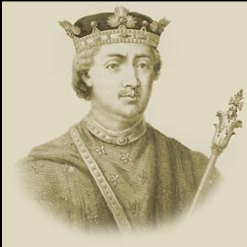
KING HENRY II (1154 – 1189)