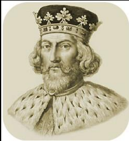
KING JOHN (1199 - 1216)