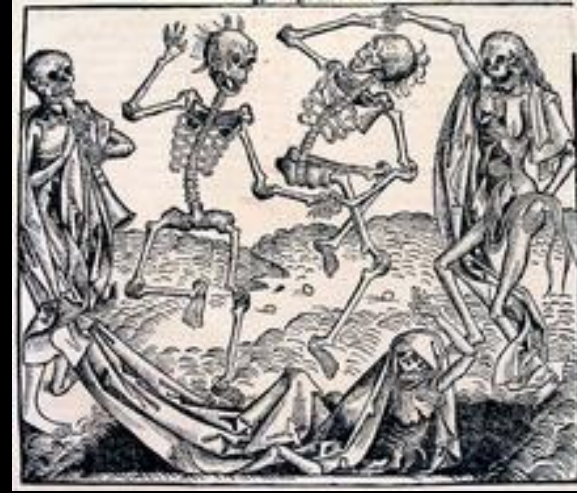
GOD'S PUNISHMENT FOR SIN