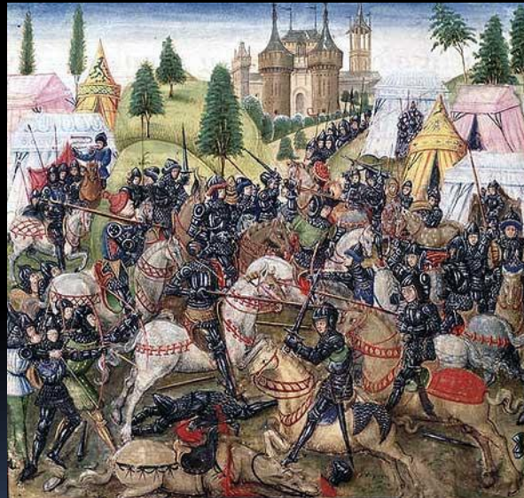
BATTLE OF HASTINGS William the Conqueror