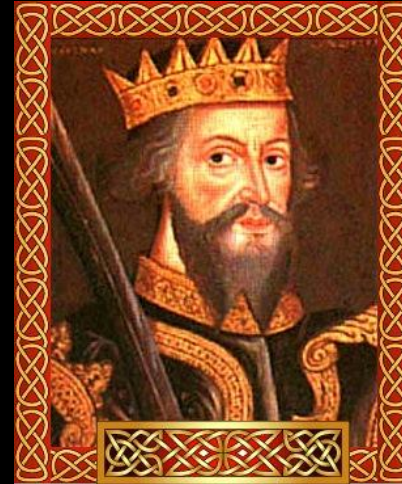
WILLIAM THE CONQUEROR

KEY EVENT IN HISTORY FOR SEVERAL REASONS