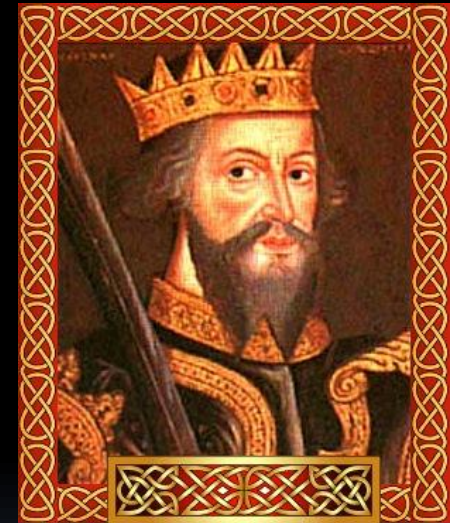
WILLIAM DUKE OF NORMANDY