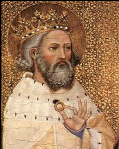
KING EDWARD THE CONFESSOR