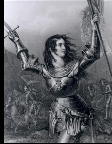
JOAN OF ARC

KEY EVENT IN HISTORY FOR SEVERAL REASONS